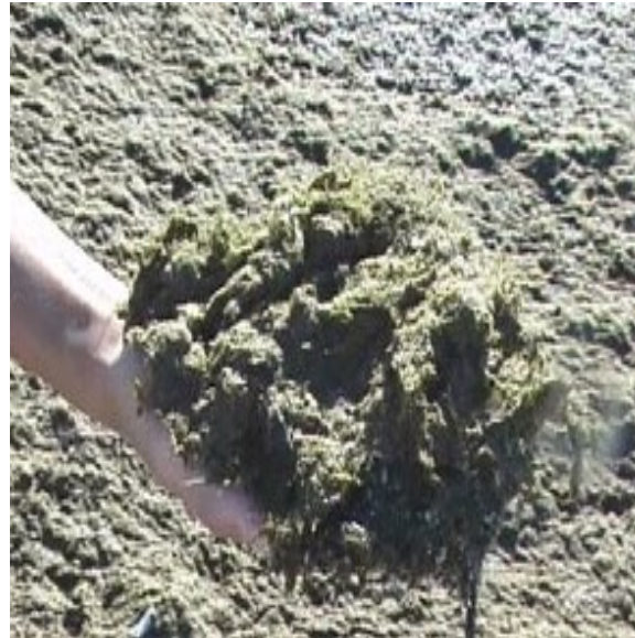
Great Lakes WATER Institute

L ake Champlain also experiences blooms of non-toxic green algae such as Cladophora . This species grows attached to rocks and breaks off in clumps that may appear brown or green and stringy. Cladophora do not form paint-like oily slicks. Other examples of algae that are not cyanobacteria may look like long green hairs, green clumps, yellowish clouds, or gelatinous brown balls.